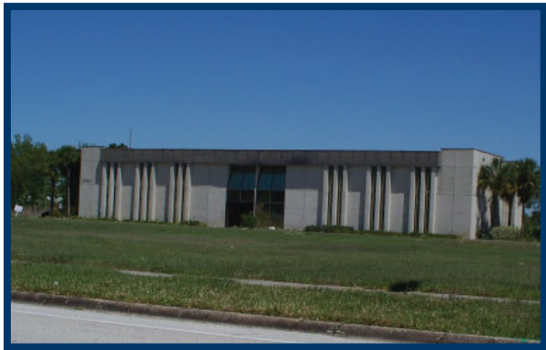
VIEW FROM LAKEHURST DRIVE