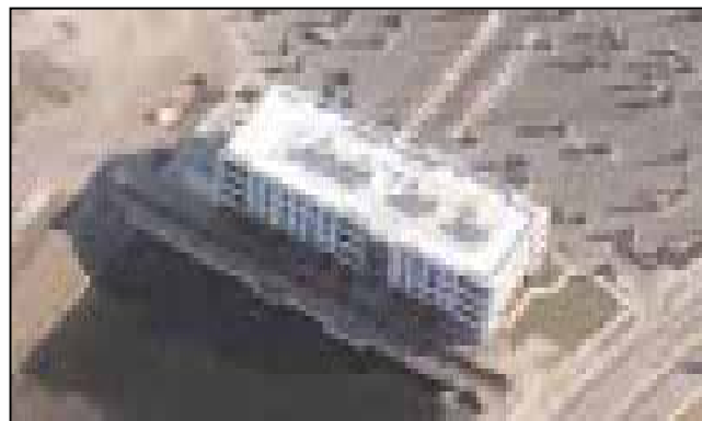
Mosaic 113,000sf Office