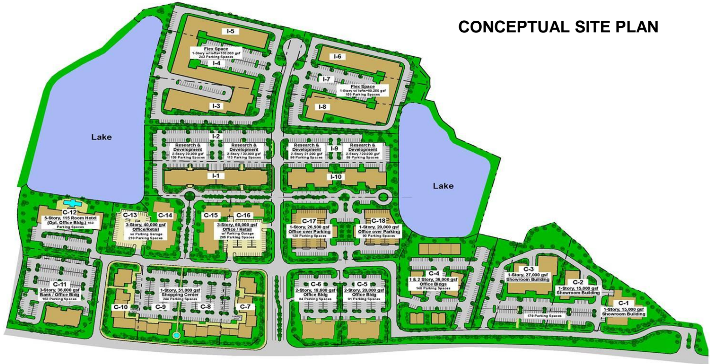
CONCEPTUAL SITE PLAN