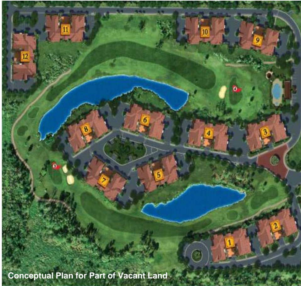
Conceptual Plan for Part of Vacant Land