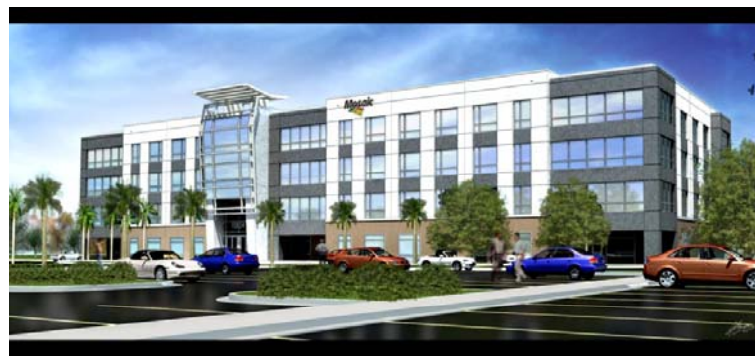
Mosaic 113,000sf Office