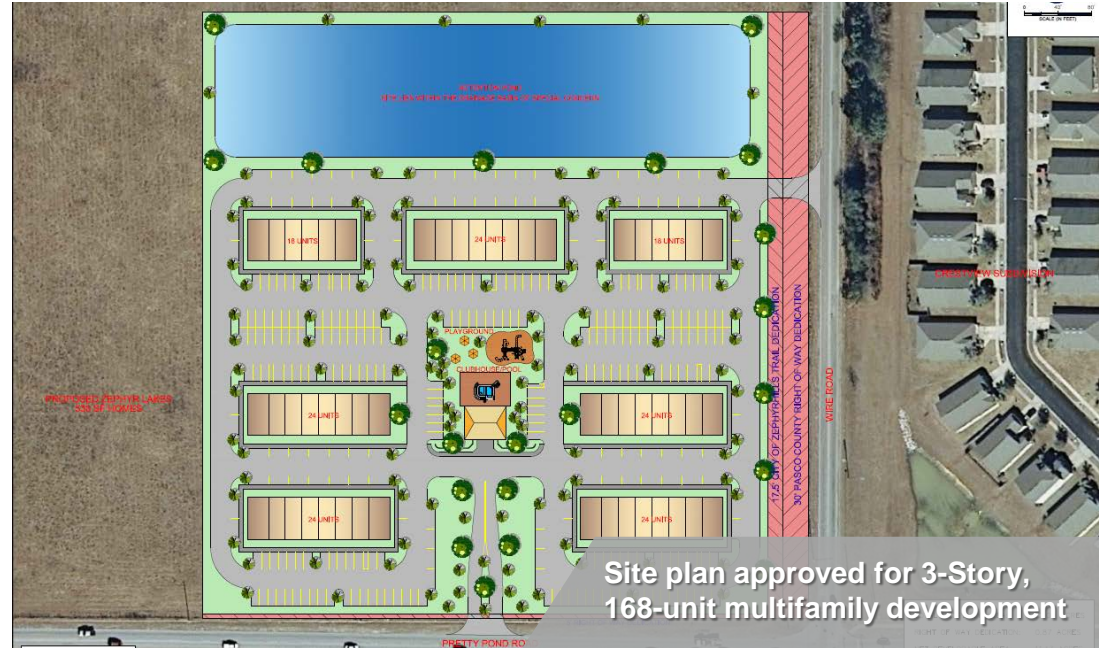
Site plan approved for 3-Story, 168-unit multifamily development