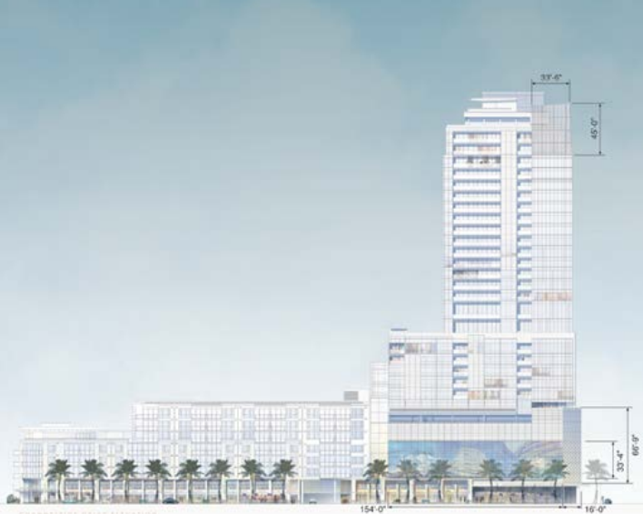
2006 Phase II - Entitlement Rendering