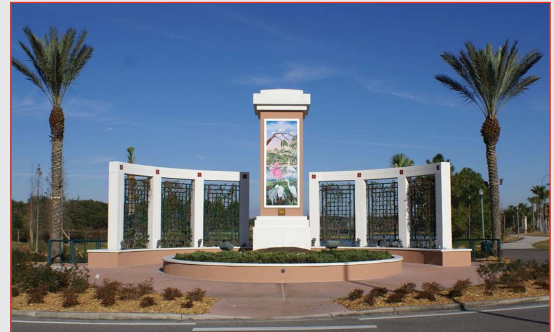
Entrance to Brandon Parkway

54 Acres MOL, Mixed Use Site Brandon, Hillsborough County, Florida 33511