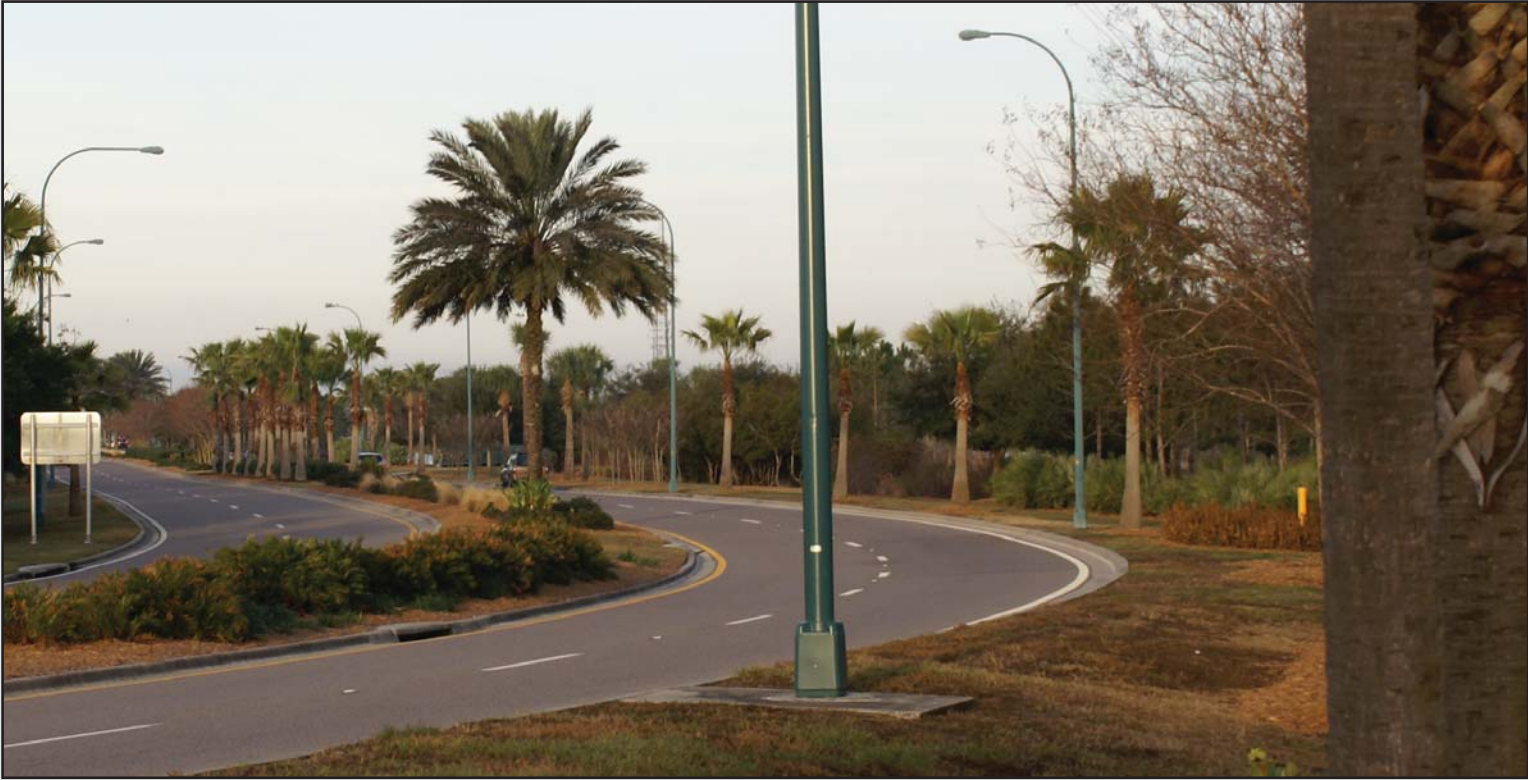
Brandon Parkway looking west. 54 acres is on the right